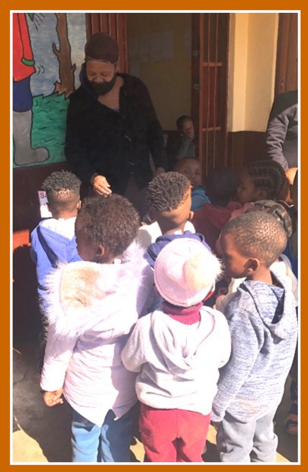
Sanitising time at Mpipi Crèche