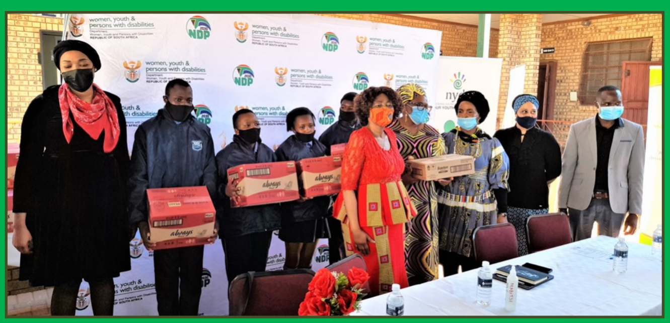
Handing over of sanitary towels to Botlokwa Special School.